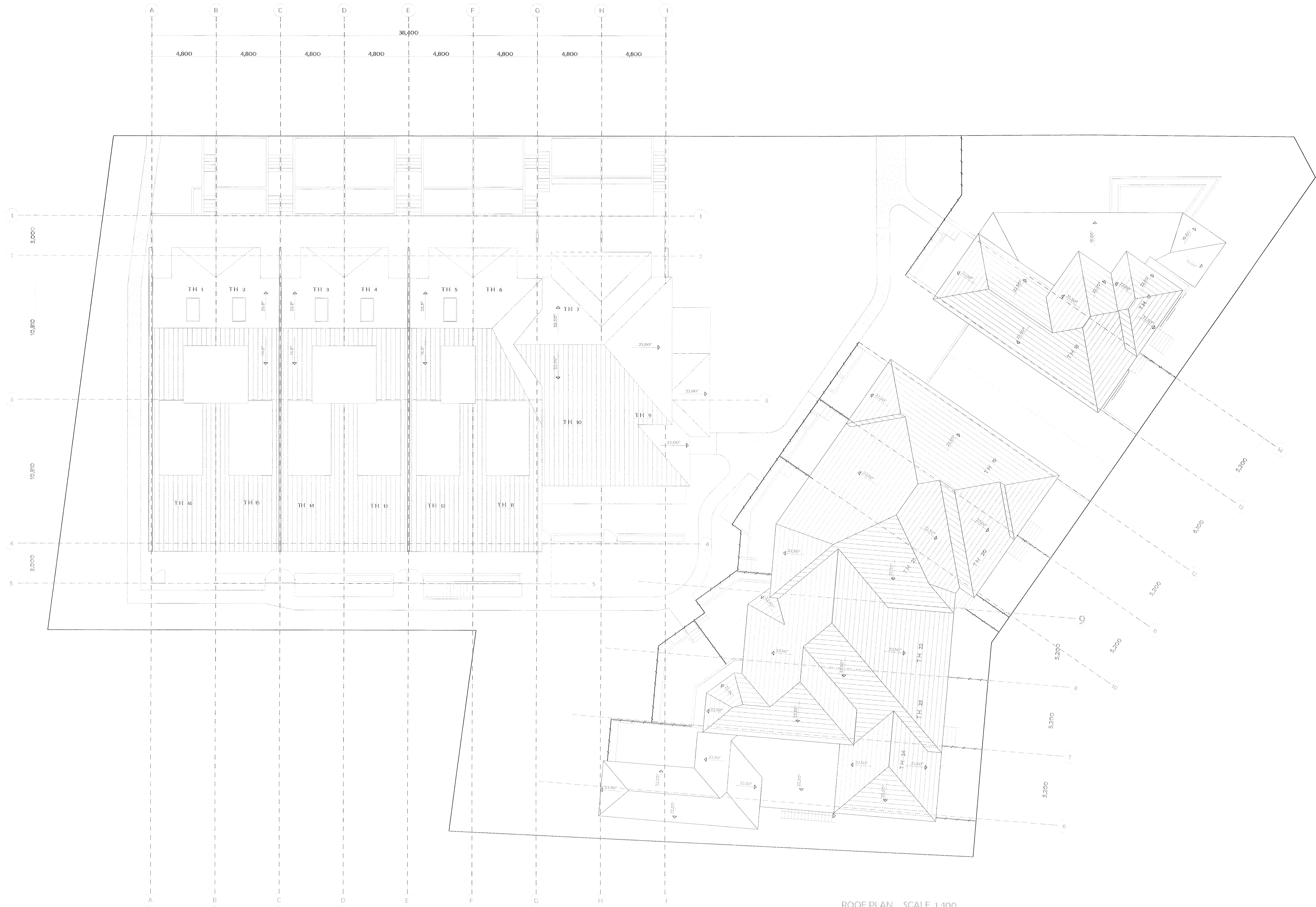
ROOF PLAN SCALE 1:100

URBAN LINK PTY.LTD © Copyright This drawing remains the property of Urban Link pty ltd. It may be used for the purpose for which it was commissioned & in accordance with the terms of engagement for that commission. Unauthorised use of this drawing is prohibited. Do not scale drawings Verify all dimensions on site