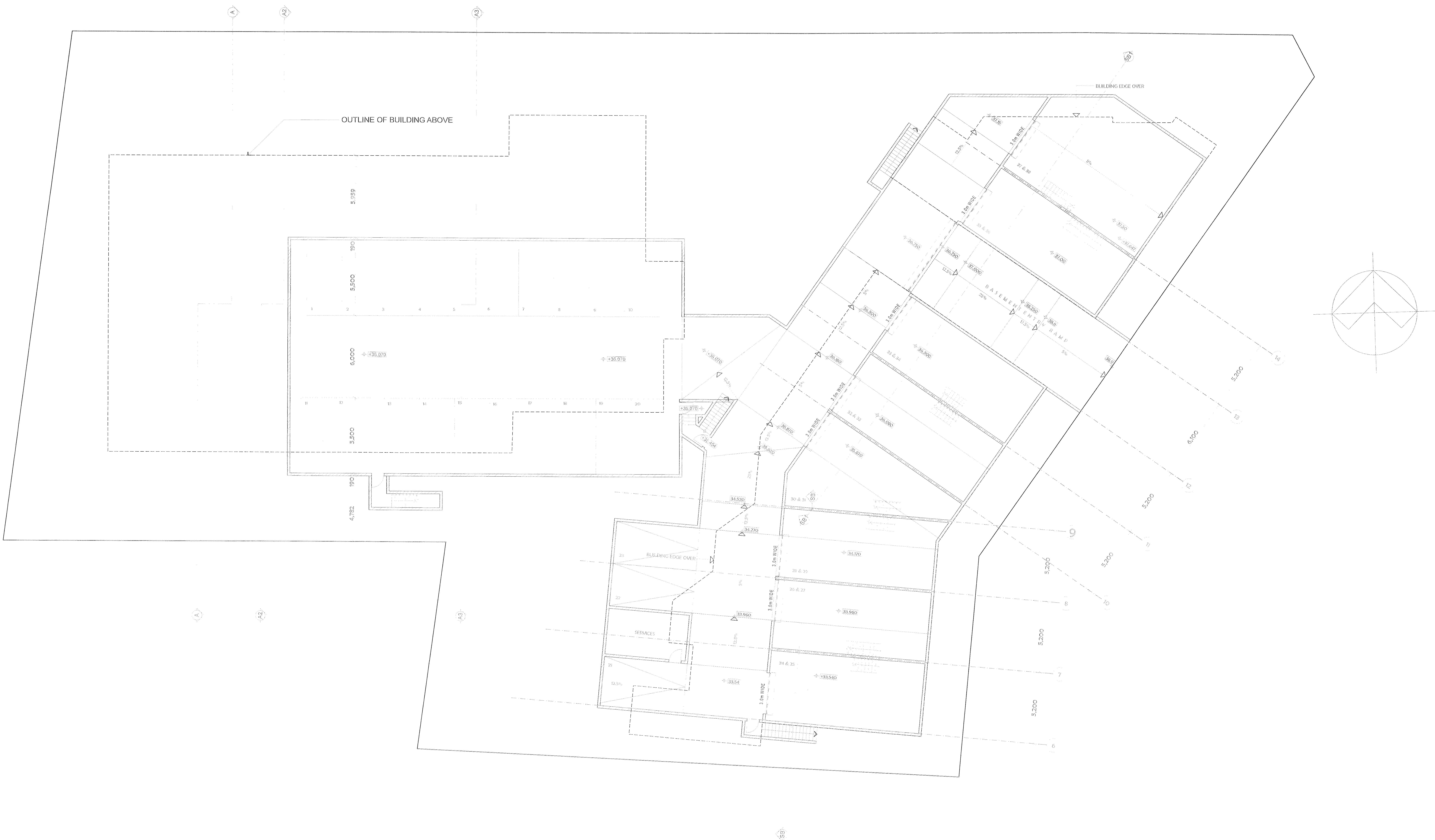
BASEMENT FLOOR PLAN SCALE 1:100